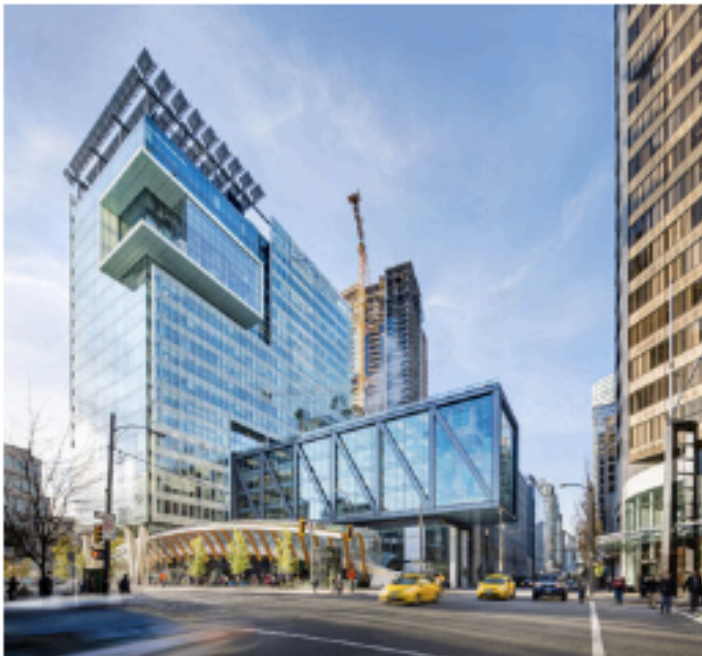
Henriquez Partners Architects