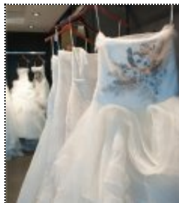
Vera Wang Luxe Collection