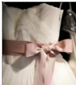
Vera Wang Spring 2012 Collection